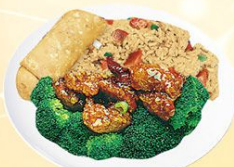
General Tso's Chicken Combo