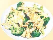
Chicken w. Broccoli