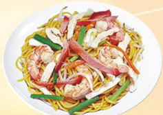
House Special Lo Mein

Two Egg Rolls Crab Rangoon Chicken Fried Rice - Lg. Chicken w. Mixed Veggies - Sm. Chicken Lo Mein - Sm. General Tso's Chicken - Lg. White Rice - Lg.