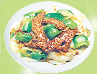
Pepper Steak w. Onion