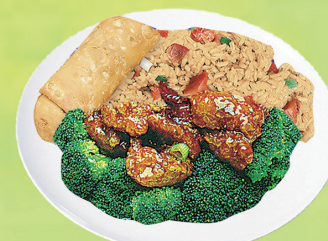
General Tso's Chicken Combo

All Additional Changes Will Be Charged $0.50 We can alter spice according to your taste.