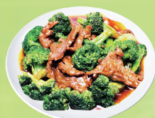
Beef w. Broccoli