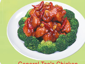
General Tso's Chicken