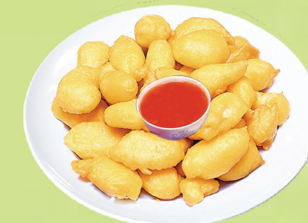
Sweet & Sour Chicken