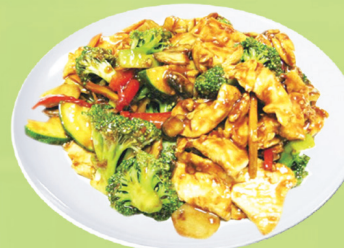
Chicken w. Garlic Sauce