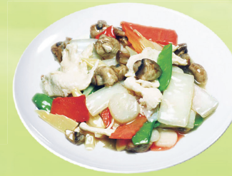
Moo Goo Gan Pai