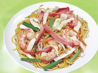
House Special Lo Mein

Two Egg Rolls Crab Rangoon Chicken Fried Rice - Lg. Chicken w. Mixed Veges - Sm. Chicken Lo Mein - Sm. General Tso's Chicken - Lg. White Rice - Lg.